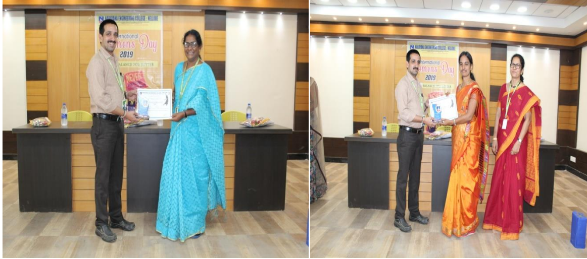
Distribution of certificate and memento for staff members