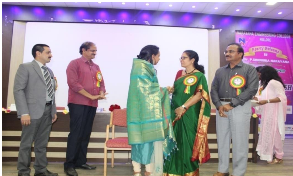
Felicitation to the chief guest