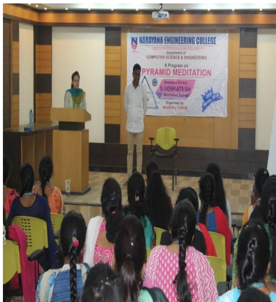
Introducing chief guest