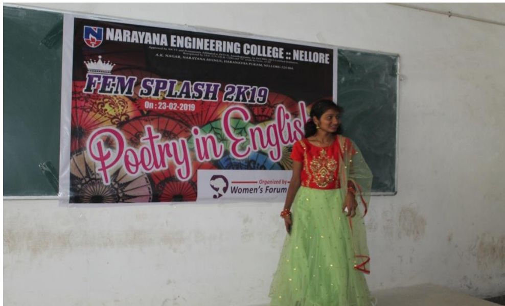
Participants in Poetry in English