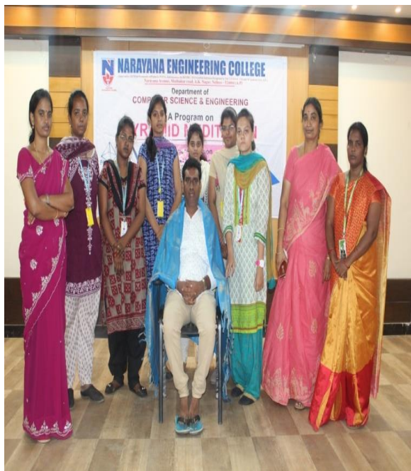
Felicitation to the chief guest