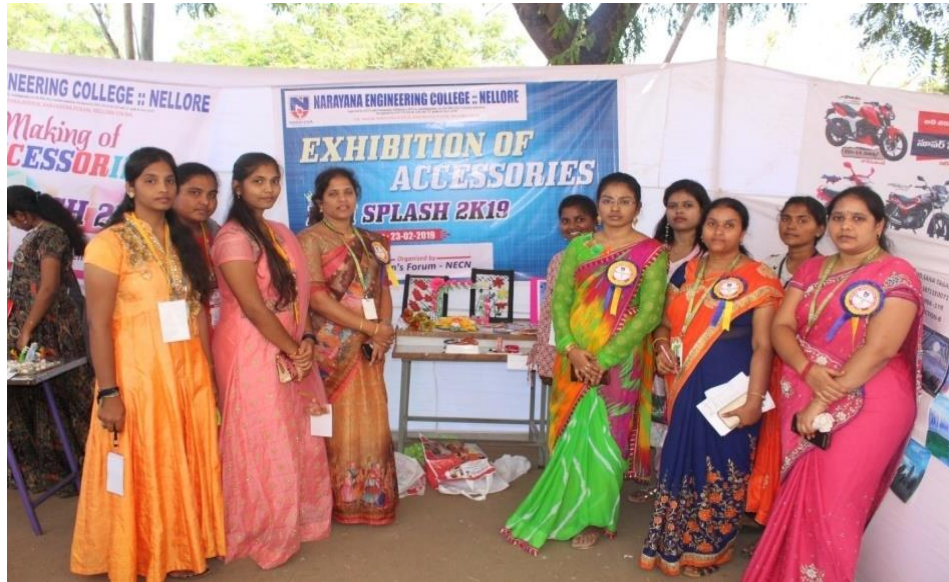
Group photo of Participants in Exhibition of accessories