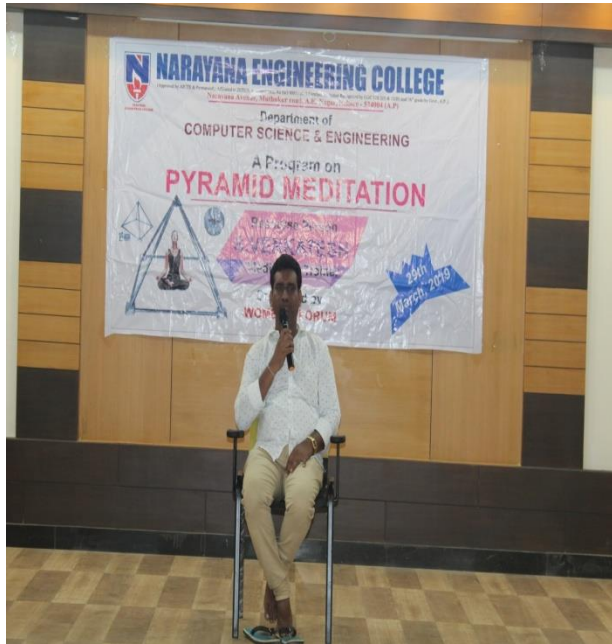
Chief guest giving training