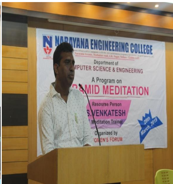
Addressing the gathering