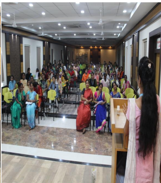
Speech given by the student