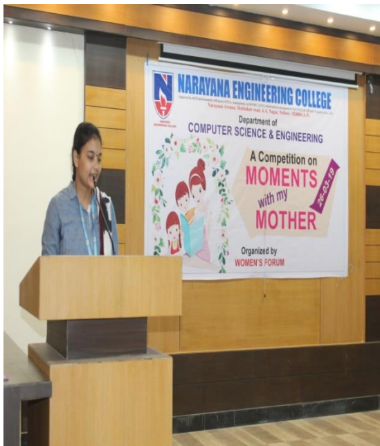
Student giving welcome note to audience