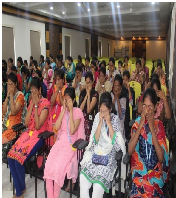
Students doing activities