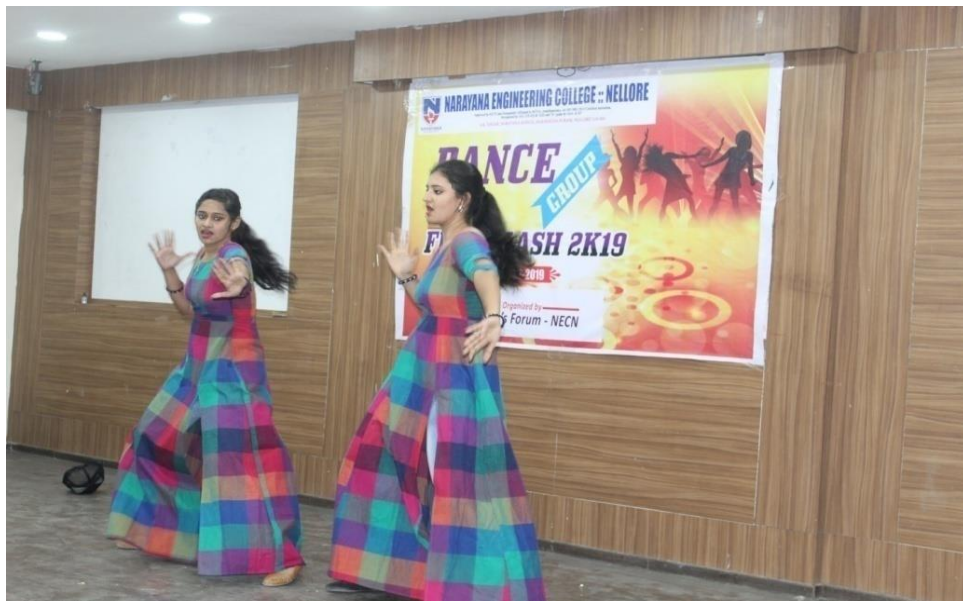
Participants in Group dance