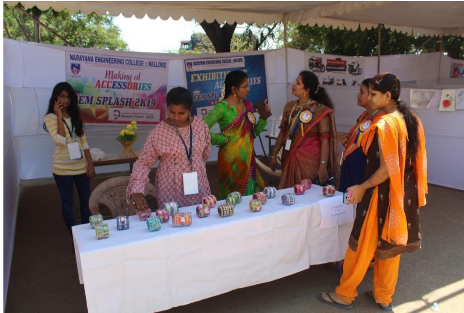
Participants in Making of Accessories