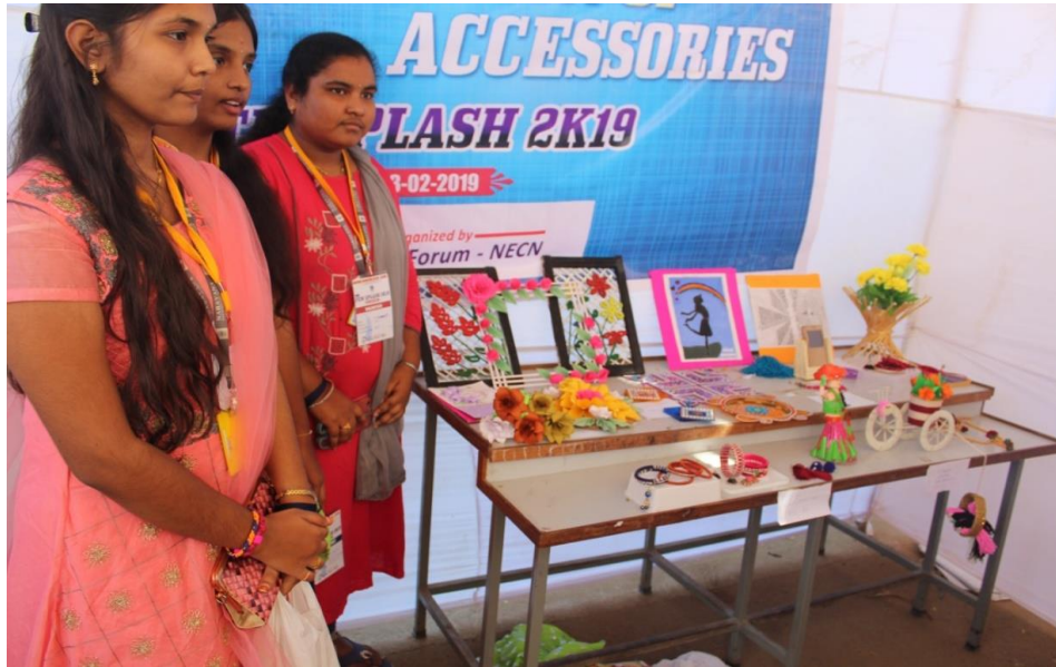
Participants in Making of accessories