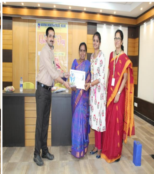
Distribution of certificate and memento for girl students