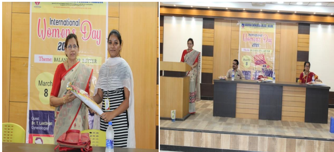
Chief guest Addressing the Gathering