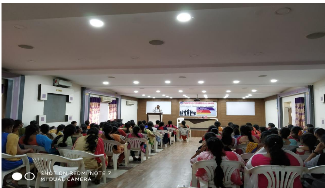
Teaching about personal development