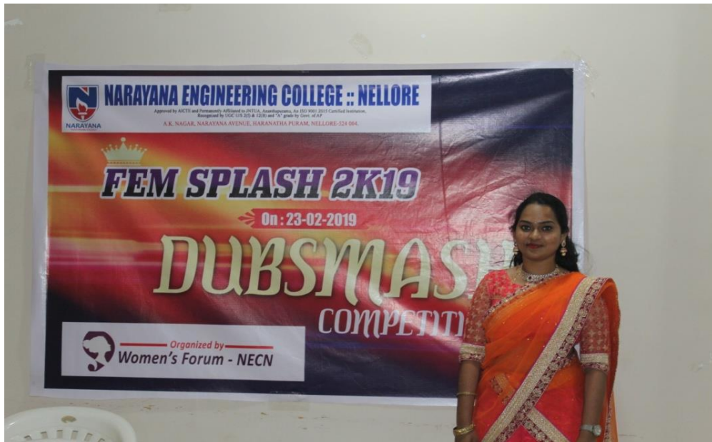
Participants in Dubsmash