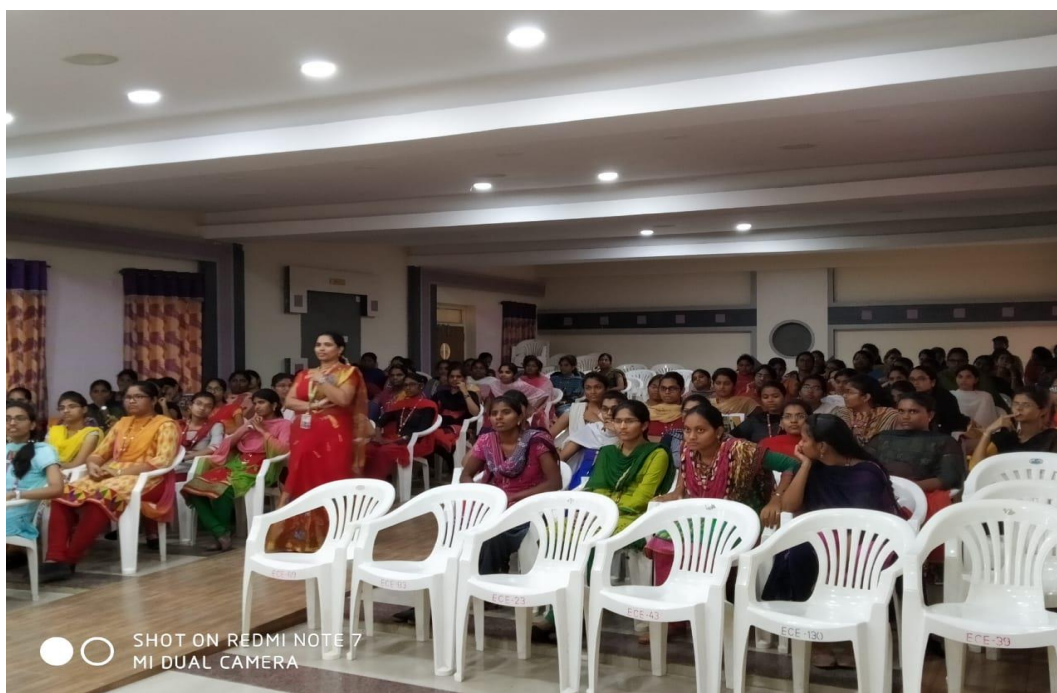
Enthusiastic listeners of the lecture