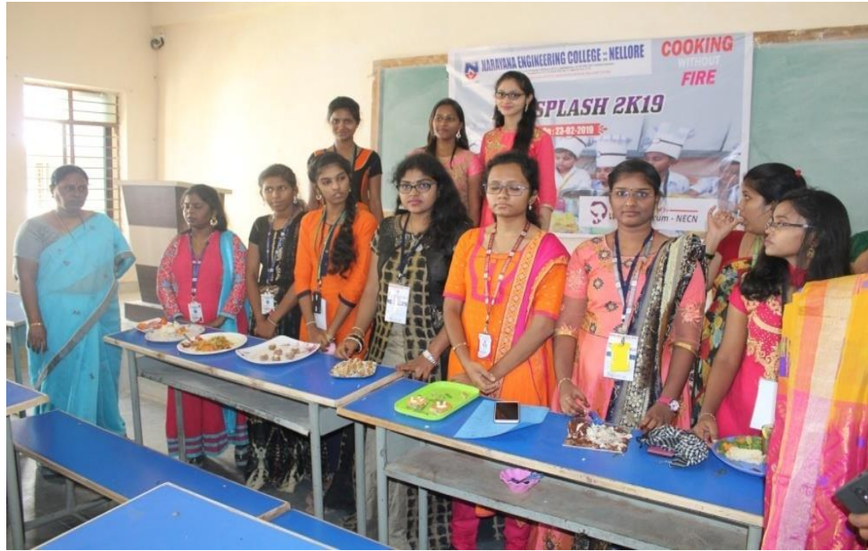
Participants in cooking without fire