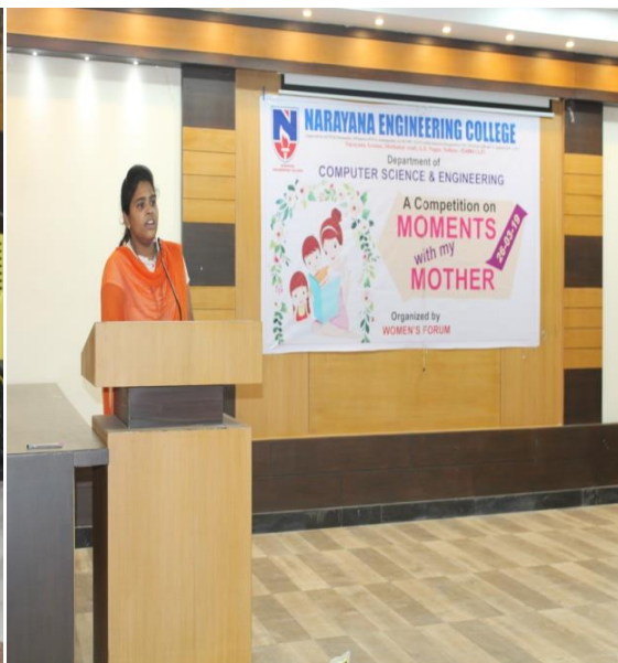
Student talking about moments with her mother