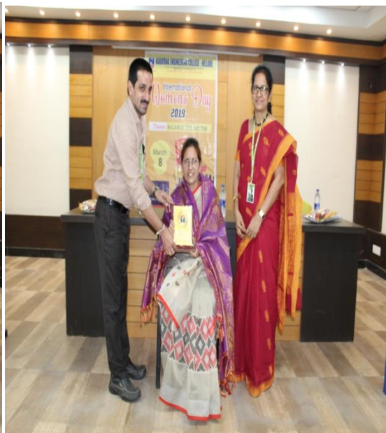
Felicitating the chief guest