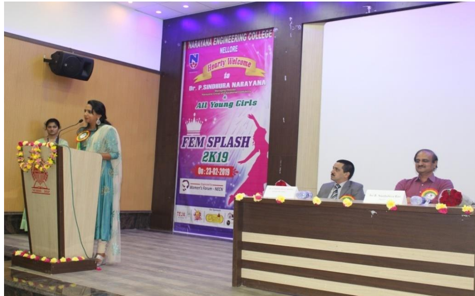
Speech by chief guest