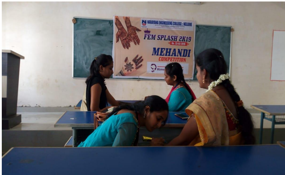
Participants in Mehendi